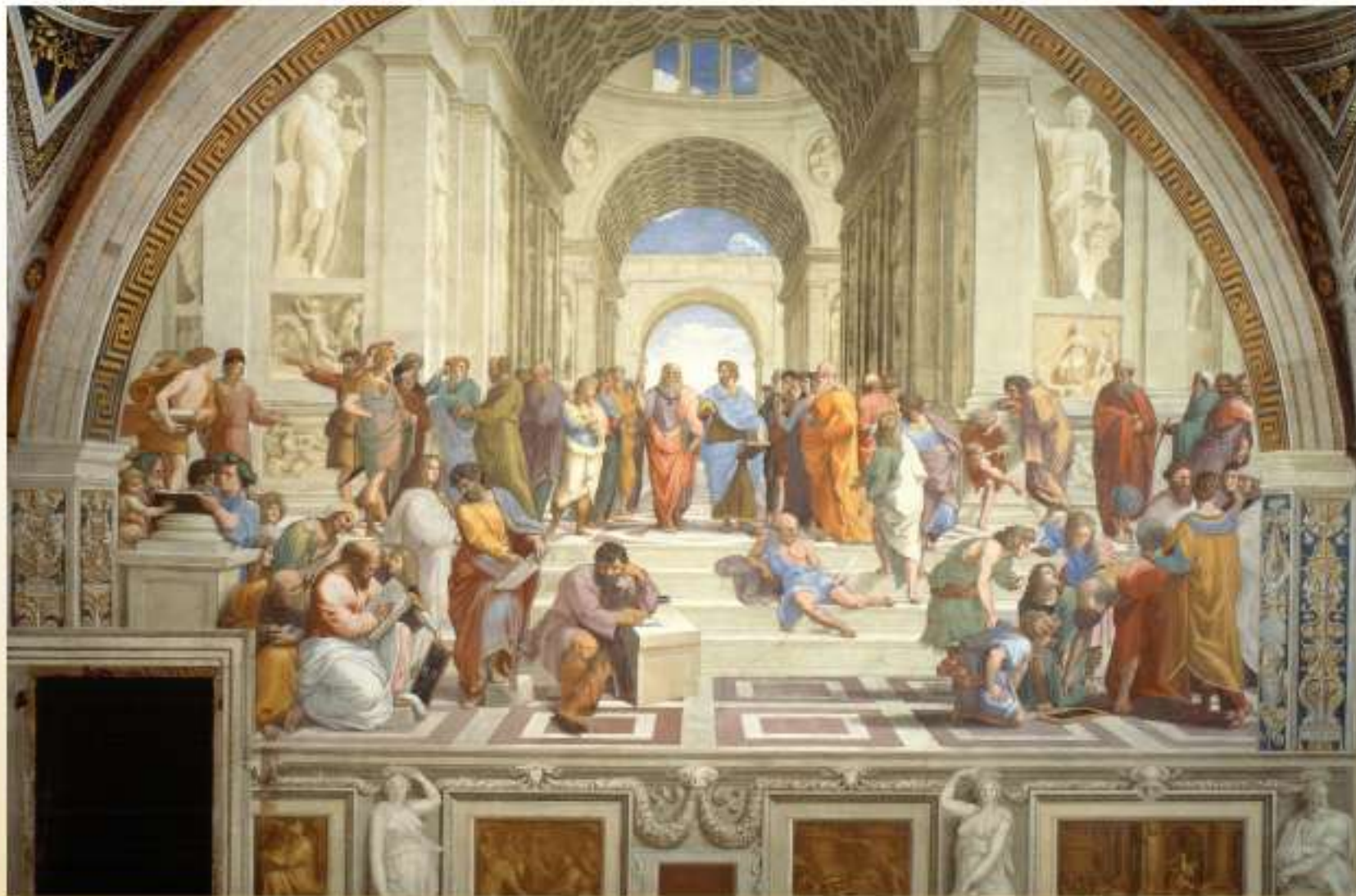
Raphael, The School of Athens, 1510