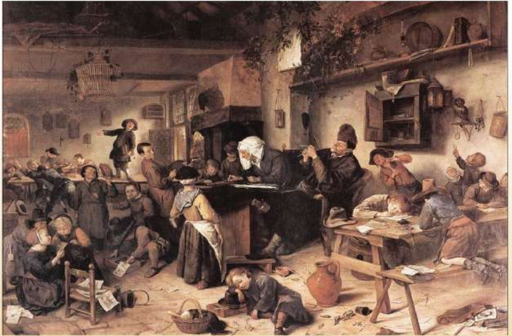
Jan Steen, A school for boys and girls, 1617