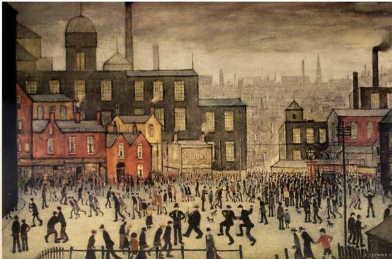
L. S. Lowry, Industrial landscapes, 1943